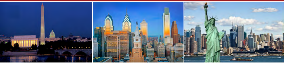
The University of Delaware is located in Newark, Delaware, within easy driving distance of Washington, DC, Philadelphia, and New York City.

*For students under the age of 16, please apply for "MPF Little Masters Division"